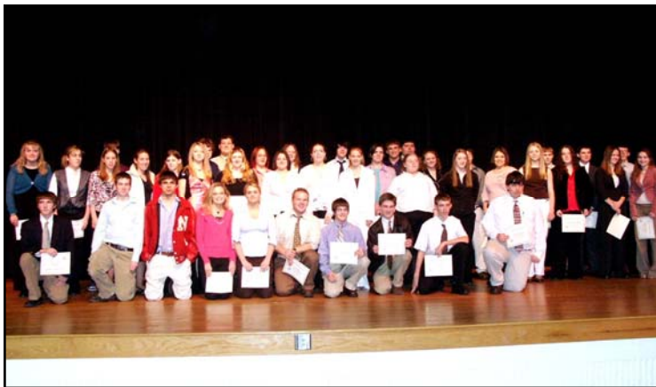
The first, second and third place winners gathered on stage for their photo opportunity.