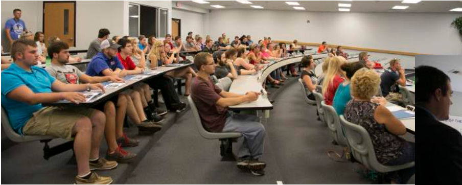
4: New Student Orientation in Ash Flat and Mammoth Spring