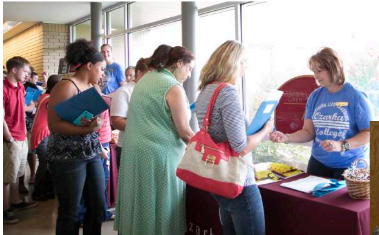
5: New Student Orientation in Mtn. View & Melbourne