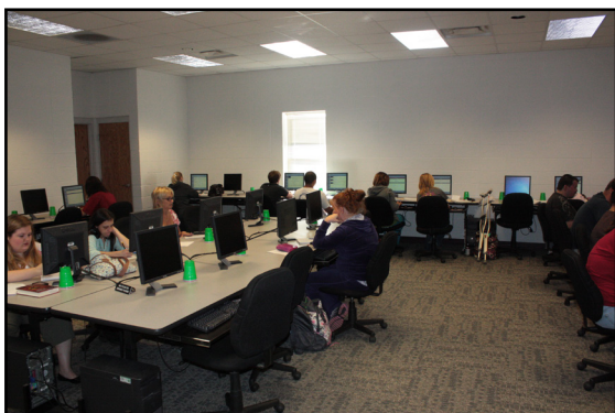
Students will be able to enjoy additional computer lab space in the new Student Services Center.