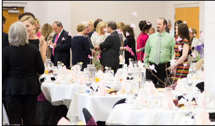
Guests are shown mingling while being welcomed with a reception of h'orderves and sparkling cider.