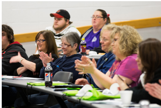
Students learned valuable information at the Employability Skills Conference, including how to dress for interviews. The conference was sponsored by the Career Pathways Initiative and Student Success Center.

The conference, which was sponsored by the Ozarka College Career Pathways program