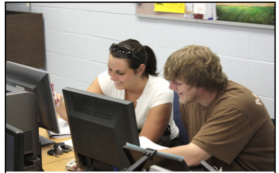
Students work in the computer lab currently located in the John E. Miller Education Complex on the Melbourne campus. After the completion of a new Student Services Center, students will have access to more computers and study spaces.